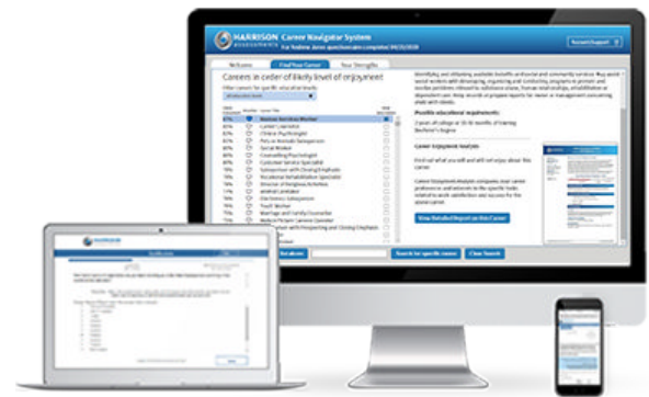
Online Interactive Career Portal